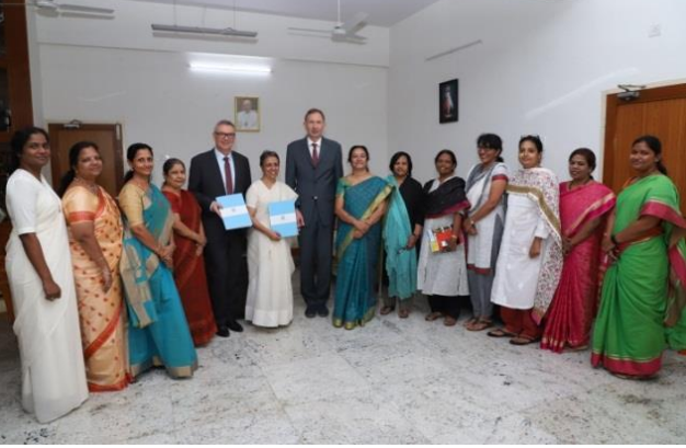
The Delegates with the Heads of the Departments of Social Sciences Lighting of the 175 Years of HOPE Candle, LHU UK at SMC February 14, 2019