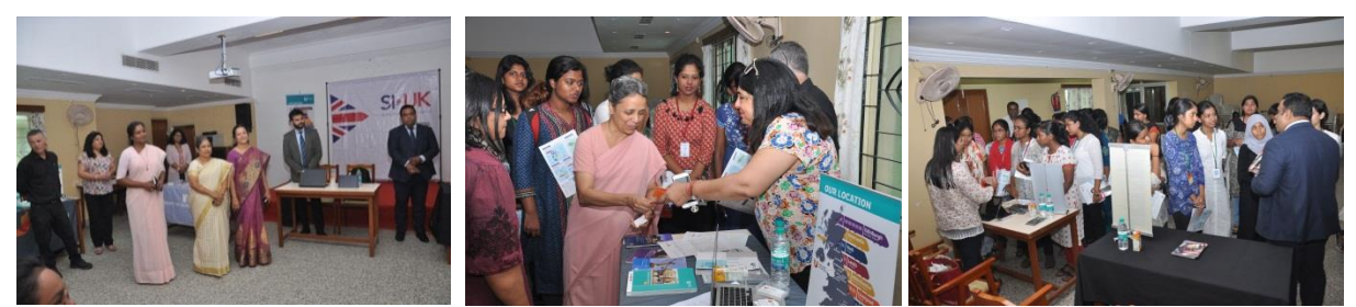
UK Education Fair at Stella Maris college was organised on July 12, 2018 representing Universities from UK namely University of Leeds, Coventry University, Northumbria University, London Metropolitan University, Teesside University