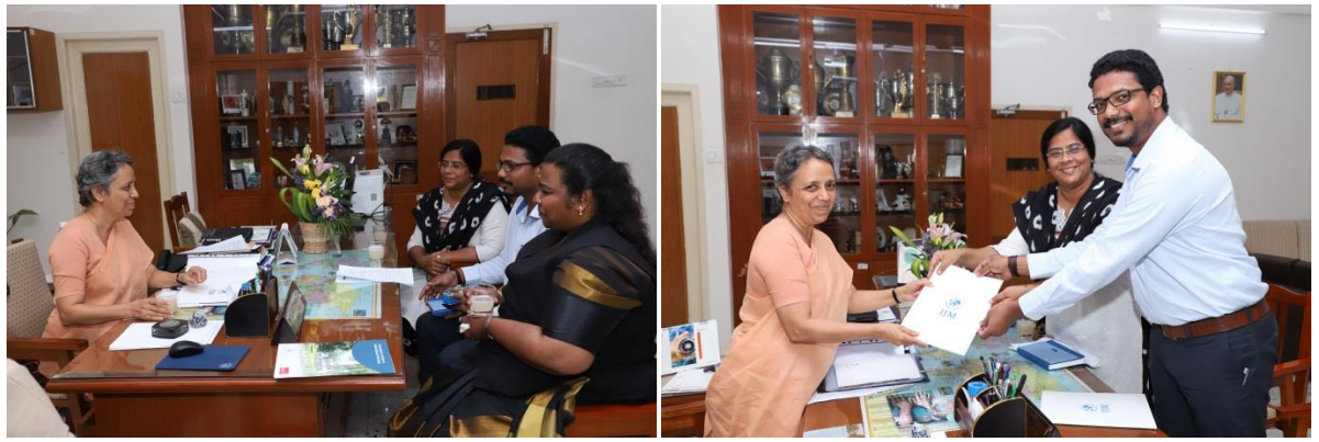
Signing and Exchange of the MoU with International Justice Mission, Chennai