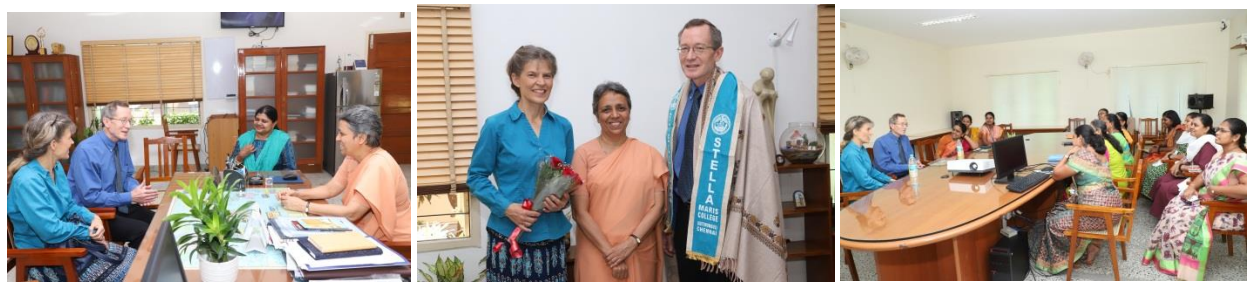
Dr....., LeTourneau University, Texas visit SMC , interacts with the faculty of the Department of Computer Sciences